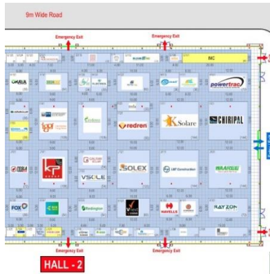
Prime location in hall 2

Benefit from common infrastructure, meeting rooms, a lounge and further synergies