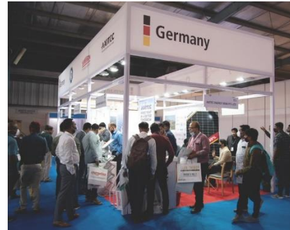
Fully furnished booth