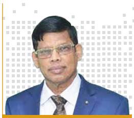
Mr Upendra Tripathy

Hon'ble Minister of Energy, Government of Gujarat