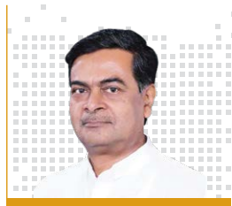
Mr RK Singh

Hon'ble Minister of Railways & Commerce & Industry, Government of India