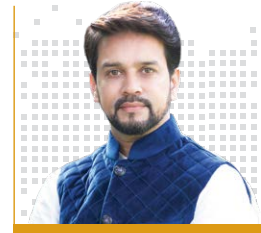
Mr Anurag Thakur

Hon'ble Minister of State (IC) of Power and New & Renewable Energy & Minister of State (Skill Development), Government of India