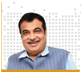
Mr Nitin Gadkari

Hon'ble Minister of MSMEs and Road Transport & Highways, Government of India