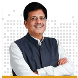
Mr Piyush Goyal

Hon'ble Minister of MSMEs and Road Transport & Highways, Government of India